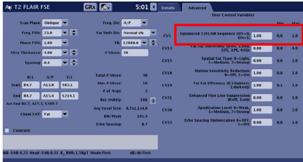
Figure 3. Optimized T2 FLAIR Sequence enabled (set to 1.00) in the Advanced Tab for T2 FLAIR FSE