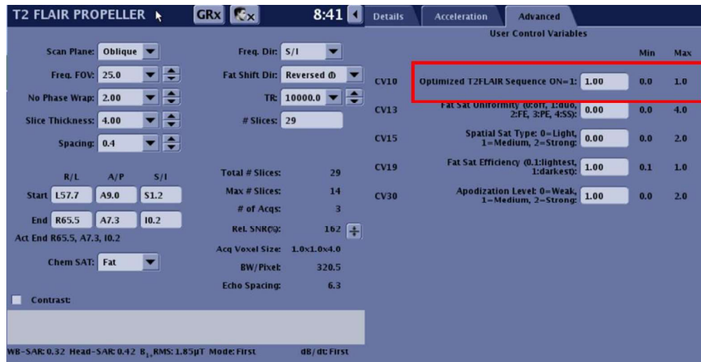
Figure 4. Optimized T2 FLAIR Sequence enabled (set to 1.00) in the Advanced Tab for T2 FLAIR Propeller