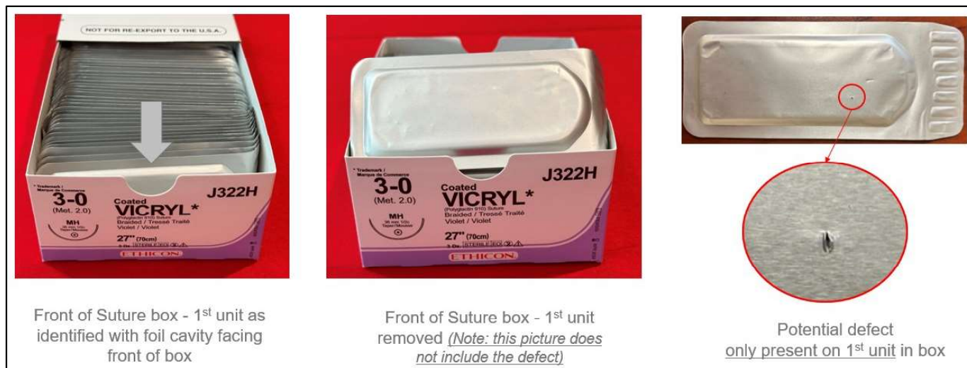
Figure 2: Sales unit box (QTY:36) indicating location of first package.

First package is defined as the package closest to the front of the box with the foil cavity side facing the box. The front of the box contains the labeling for the product.