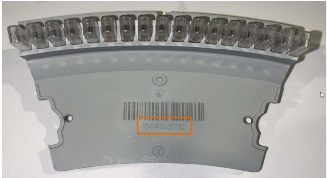
Figure 1. Location of the lot number on Atellica CH Reaction Ring Cuvette Segment

1. Enter diagnostic state ( Enter Diagnostics State in Atellica CH per Section 18 Troubleshooting of the Atellica Solutions Operator Diagnostics Online Help).